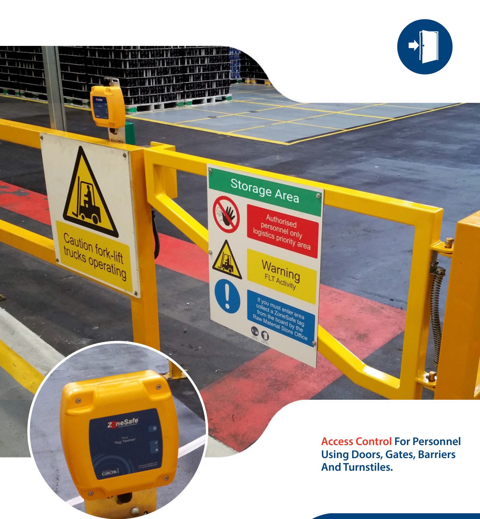
Tag Tester & Automated Gate Access